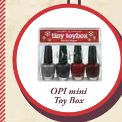
OPI mini Toy Box

BODY – Omega Hydrator – a luxurious, replenishing hydrator containing an organic Omega 3 Complex with nourishing apricot kernel oil, sweet almond extract, shea butter and protective antioxidants. This ultra-rich cream leaves the body supple, smooth and replenished.