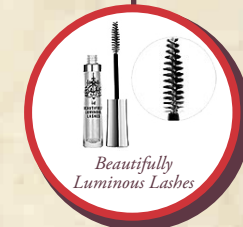
Beautifully Luminous Lashes