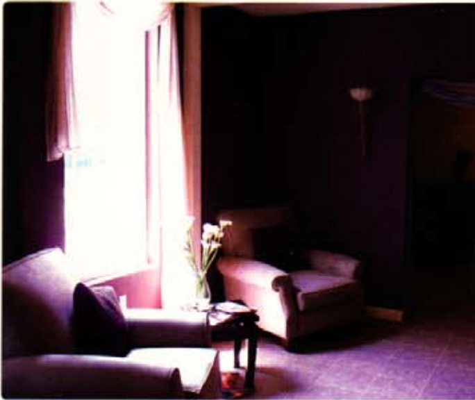
Tranquil waiting area