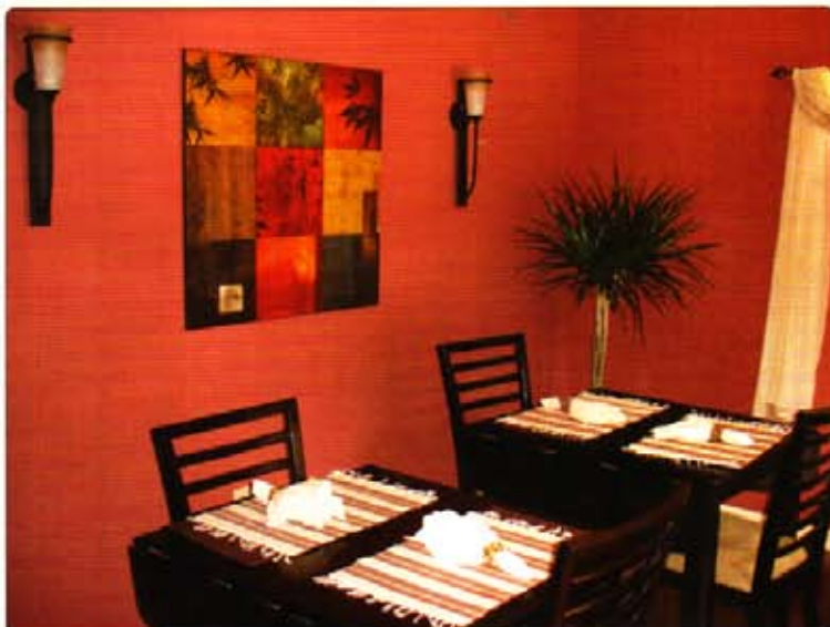
Debra J. Hester

Wide corridors leading to eight treatment rooms are thickly carpeted and softly lit by elegant sconces. Depending on the treatment, the spa's pristine rooms are tastefully equipped with state-of-the-art equipment including Vichy showers, massage tables, manicure and pedicure stations. Guests can enjoy an extensive menu of nearly one hundred services, including manicures, pedicures, exfoliating body treatments, facials, waxing, massage therapy and everything in between. Not readily available in many spas, permanent make-up and eyelash extensions are offered as well.