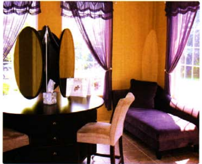
Make Up Application Room

include this new paradigm for wellness in their arsenal for achieving and maintaining good health along with their traditional doctors and state-of-the-art hospitals.